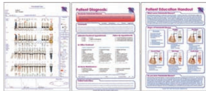
PERIO CHART TX. OPTIONS PT. EDUCATION